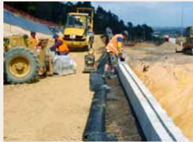
Reinforcing with Miragrid® GX geogrids.

Installation of the block wall facing, geosynthetics and the soil backfill are all in one construction process. Thus, the construction is relatively fast without the need for special lifting equipment and highly skilled labour. Reinforced segmental block walls have become an accepted practice for a fast, durable, aesthetic and cost effective retaining wall. The system is suitable for applications ranging from landscape terraces, housing developments to major structural walls.