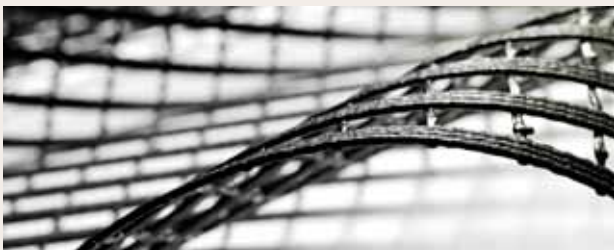
TenCate Miragrid® GX.

Both Miragrid® GX and Polyfelt® PEC are quick and easy to install and work effectively with various types of facing systems. Practical green-facing systems can also be easily adopted to blend in with the surrounding environment.