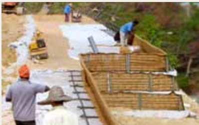
Steel mesh formwork being set-up above layers of Polyfelt® PEC geotextiles.

TenCate Polyfelt® PEC is most commonly used as the reinforcement when the soil mass consists of finer-grained backfill that has poor drainage properties. Alternatively, TenCate Miragrid® GX geogrid is typically used to reinforce coarser-grained soil backfills. This system is ideal for slopes with angles up to 80° and heights ranging from 2m to 25m. It provides a stable facing that blends with the surrounding landscape.