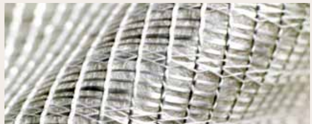
TenCate Polyfelt® PEC.