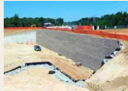
Segmental block wall nearing completion.