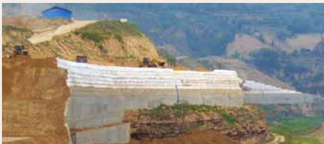
Reinforced soil wall during construction.