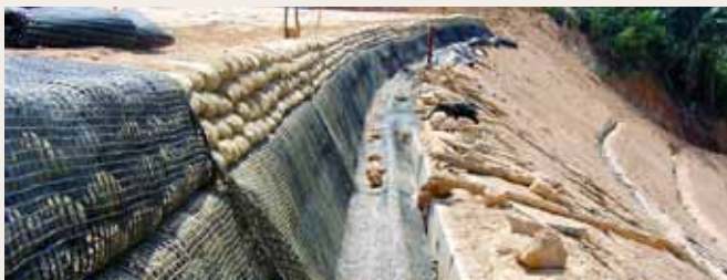
Miragrid® GX geogrids being wrapped around stacked geobags to construct a wall.

This facing system is suitable for slopes with angles up to 80° and heights varying from 3m to 50m. Ground water seepage is controlled by installing a geosynthetic wrapped stone drainage layer at the rear of the reinforced soil structure with the ground water discharged through drainage pipes into surface drains. The completed structure, when vegetated, blends easily with the surrounding environment. It is a proven and cost effective alternative to conventional concrete structures.