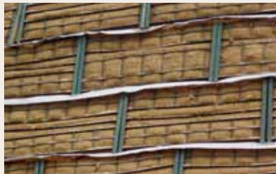
Front of a steep slope with steel mesh formwork facing nearing completion.