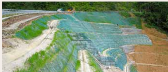
Establishing vegetation onto a completed reinforced slope.

This proven system is a preferred choice for designers and contractors alike because of the easy and rapid construction technique and, especially, its cost effectiveness.