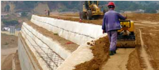
Compacting reinforced fill close to wall face.

Full-height wall facing structures typically comprise of TenCate Polyfelt® PEC (or TenCate Miragrid® GX) reinforced soil mass with full-height concrete facing panels. These concrete panels are typically precast and provide a strong, durable and aesthetic facing, making them ideal for high wall constructions for bridge approaches, highway ramps and major wall structures.